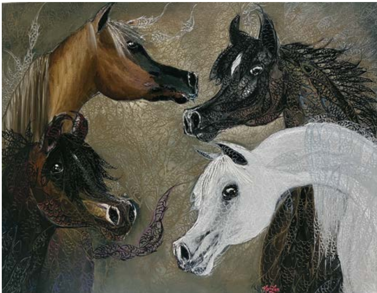
The Joy Luck Club