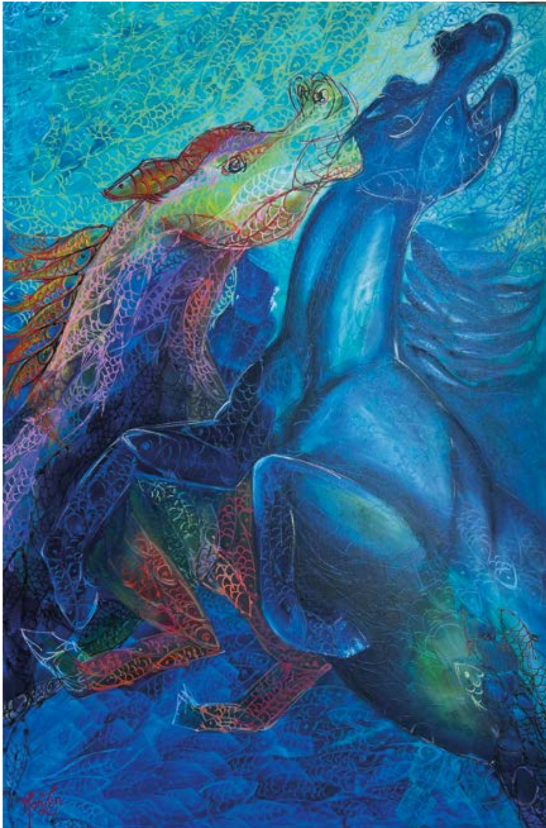
Into the Sea