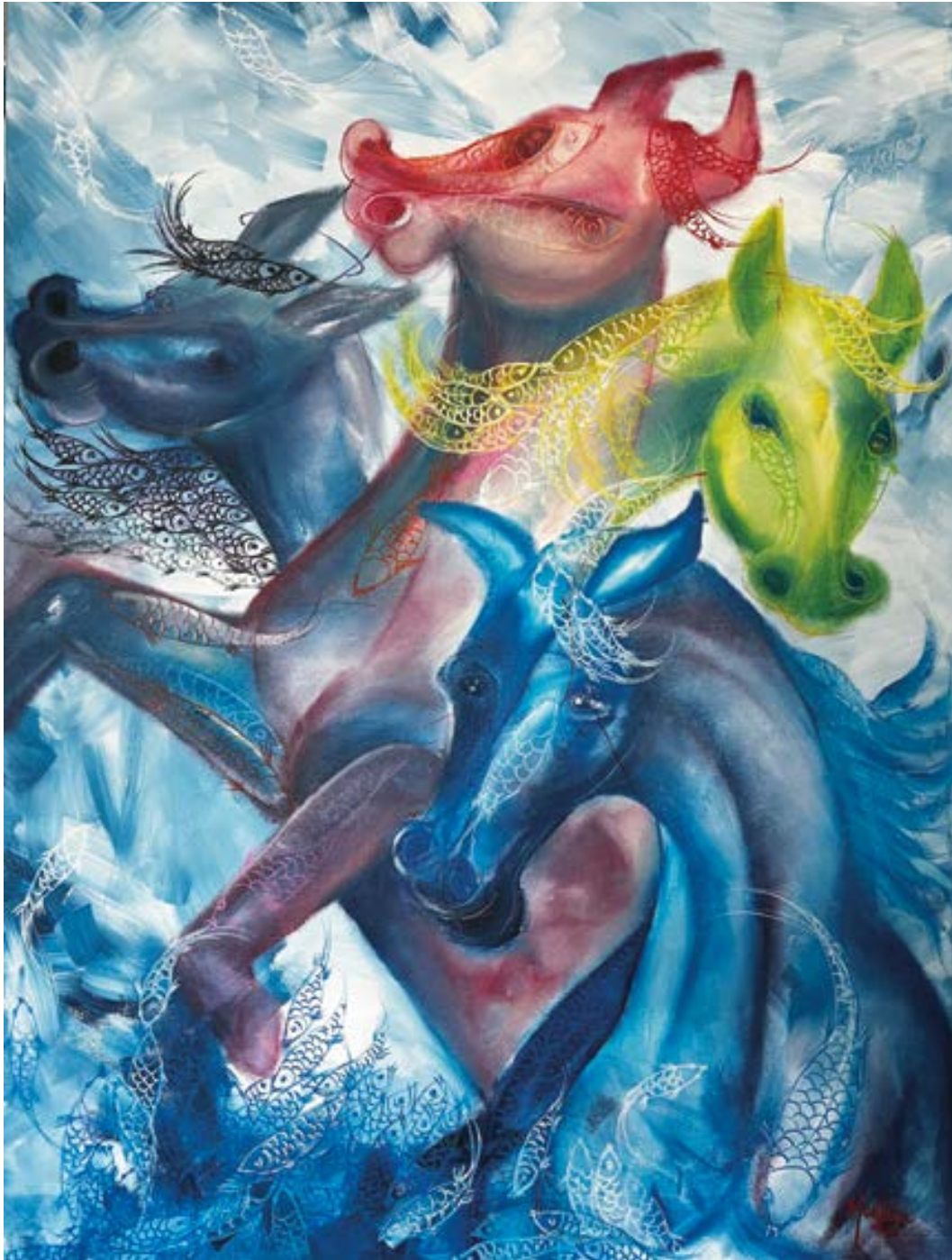
Ocean of Horses