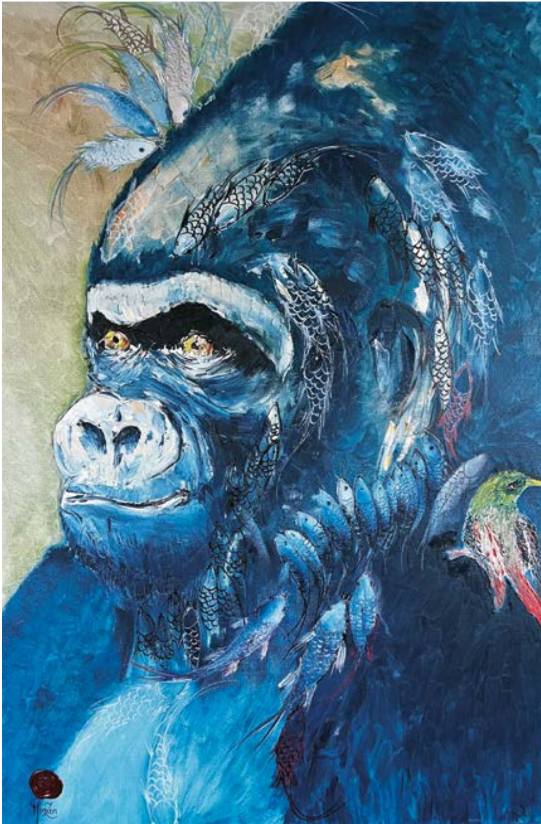
Planet of Apes